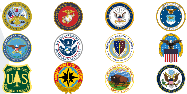
The appearance of U.S. Department of Defense (DoD) visual information does not imply or constitute DoD endorsement.

Senior agency leadership relies on Cayuse for 24x7x365 situational awareness and crisis monitoring of industry assets and shared threat information. Our watch personnel monitor, collect, and evaluate information that may impact these industry assets. We provide strategic-level and situational awareness briefings and advice for executive leaders.