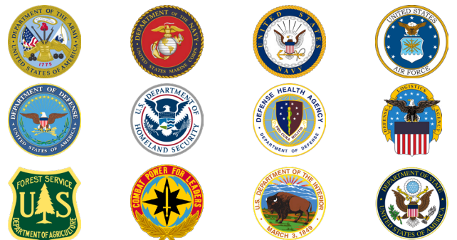
The appearance of U.S. Department of Defense (DoD) visual information does not imply or constitute DoD endorsement.